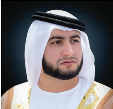
Sheikh Rashid bin Hamdan bin Rashid Al Maktoum Supreme President of the Hamdan bin Rashid Al Maktoum Foundation for Distinguished Academic Performance