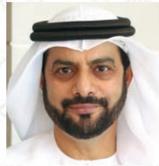
Khalifa Al Suwaidi