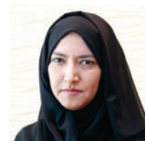
Khalifa Al Suwaidi