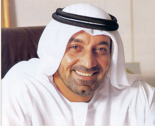
His Highness Sheikh Ahmed Bin Saeed Al Maktoum